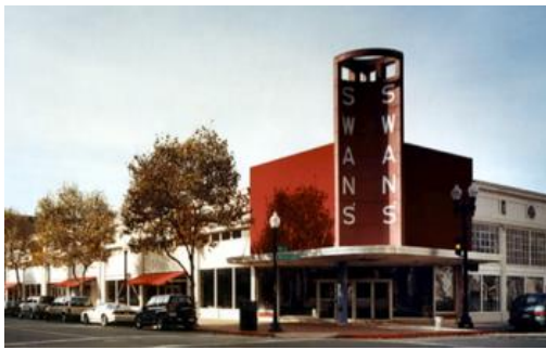
Swans Now (ish)