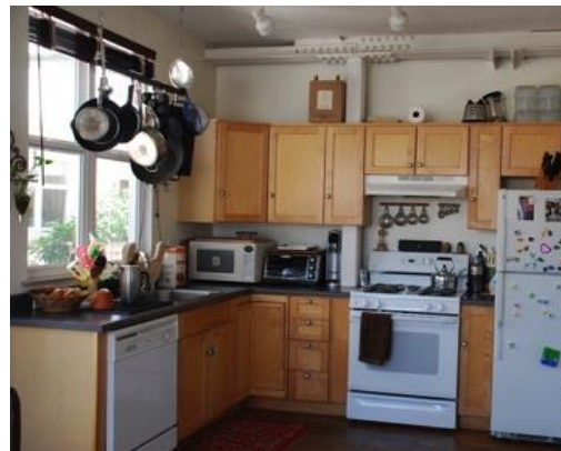
Inside Unit V: dining area and kitchen. Walk-in pantry not shown.