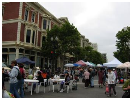
Farmers Market on our block every Friday