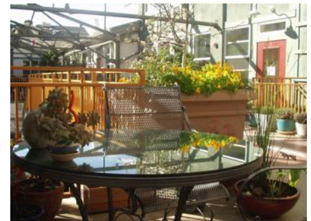
Unit V Patio is connected to the larger community patio space