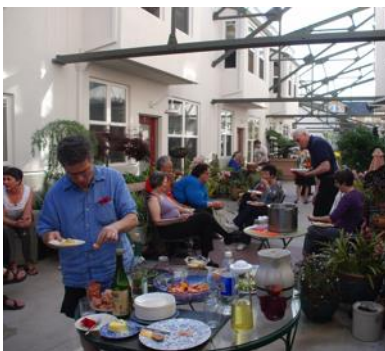
Potluck on the Swans Walk after a work party