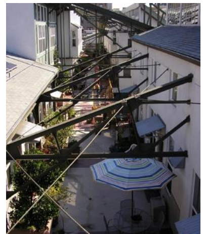
Birdseye view of Swans famous architecture