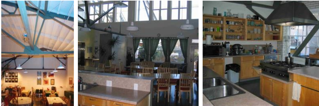
Common house dining room, gathering space, and commercial kitchen. Great for parties, performances, meetings.